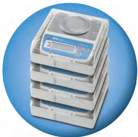
Stackable Carrying Case (Standard)